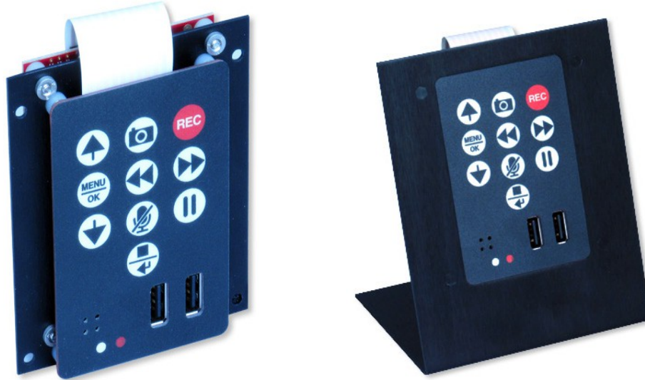
Figure 3: Left: This compact (3 x 3.5 x 1”) eDVR assembly is engineered for direct front panel mounting, with two USB media ports accessible through openings in the integrated keypad. Right: The assembly flush-mounted in a panel cutout (Sensoray 4012DEMOKIT).