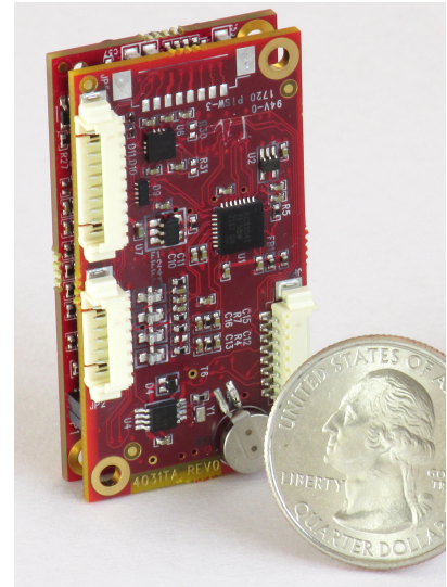
Figure 6: This ultra-tiny eDVR records analog HD or SD to USB and/or MicroSD (Sensoray 4031)

These eDVRs offer a number of interesting possibilities. For example, OEMs can now easily develop equipment that provides a customer upgrade path or OEM migration path from SD to HD cameras. Also, they allow standardized hardware to be used in different equipment versions with different resolutions. In some cases there may be no technical performance benefit at all to HD – its sole advantage may be to allow the OEM to tout HD capability and thereby establish a competitive marketing edge.