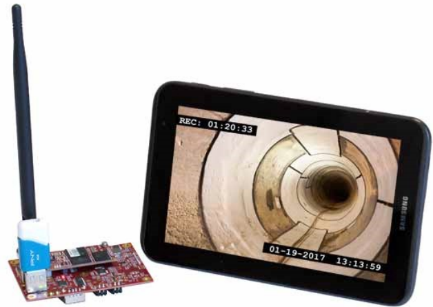
Figure 2: Left: This eDVR was configured for wireless operation by simply attaching a WiFi adapter (Sensoray 4011 eDVR with WA0001 WiFi adapter). Right: A Samsung tablet computer displays eDVR video conveyed via WiFi.

To facilitate this, many eDVRs support wireless operation via a WiFi adapter plugged into one of the eDVR's USB ports. Taken to the limit, this allows an eDVR to be operated without a monitor or keypad.