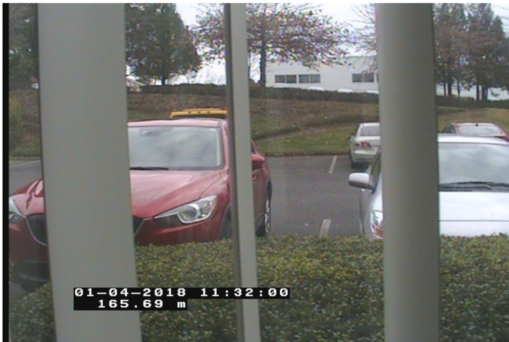
Figure 4: eDVR screenshot, showing two lines of text overlay. Top line: date/time from eDVR clock. Bottom line: camera position from eDVR's incremental encoder interface.

A common requirement for eDVRs is to superimpose the current time and date onto the live video prior to recording it, so as to visually mark the video with its creation time. To satisfy this requirement, eDVRs provide a real-time clock, which keeps track of the time and date, and a tightly-coupled video overlay engine. The overlay engine automatically superimposes the time and date – accurate to one video frame time – as text on the video.