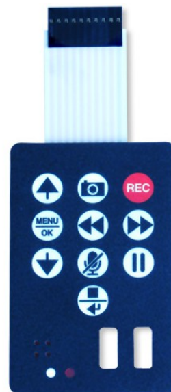
Figure 1: Solid-state eDVR keypad with capacitive touch keys and cutouts for USB storage media (Sensoray 4011TB)

All OEMs strive to give their equipment a professional look and feel. This is often achieved, in part, by using an aesthetically pleasing, custom keypad which matches the equipment's color theme. Obviously, keypad color doesn't matter to an eDVR, but other keypad attributes do matter: every keypad has a unique layout and unique key functions that are tailored to the equipment. To support these variations, eDVRs typically provide a means for OEMs to define key functionality and to logically map keypad switches to particular eDVR connector pins.